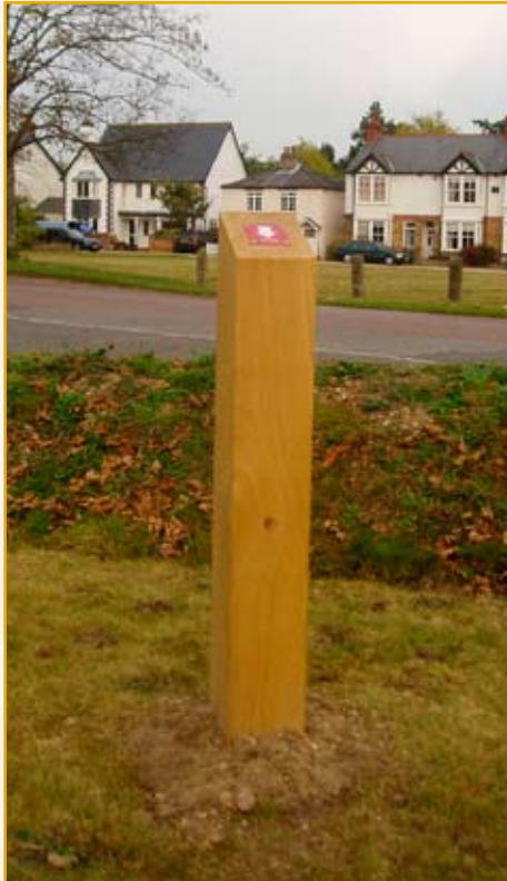
Marker post at the layby on West Common Road where the 1000 metre circuit turns back for home

So please go to www.gxfunrun.co.uk , download an application form and start training now!